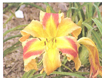
Payne Daylily 'Rodeo Clown'